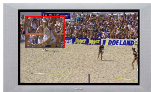
Fig. 1. The main window shows normal-play fragments with the audio also being rendered corresponding to this window, whereas the PiP window shows video corresponding to the fast search.

compressed images and MPEG-2 compressed normal-play audiovisual fragments are retrieved from the storage medium. The normal-play video fragments are MPEG-2 decoded and mixed with a downscaled MPEG-2 decoded fast-search video signal. The resulting PiP is depicted in Fig. 1. The navigation